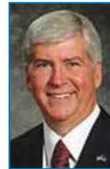
Governor Rick Snyder

Business and individual sponsors are needed to make this year's Career Focus Luncheon another success. Please call the Foundation at