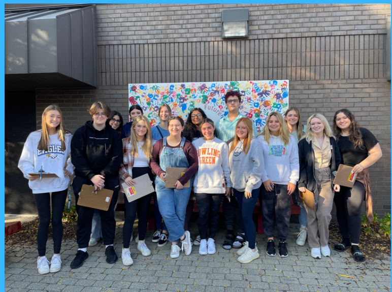
Future Educators visit Messmore Elementary to support preschool students.

SOAR will be hosting their 2nd meeting Oct. 18 after school in the commons. This meeting will be featuring therapy dogs as a way to improve the mental health of our students.