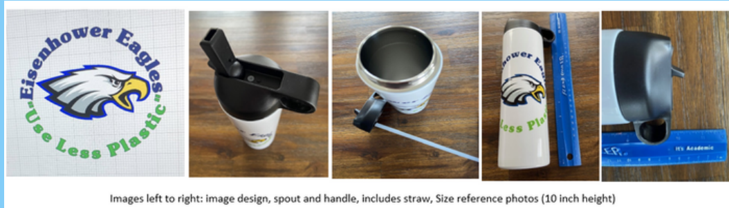
Images left to right: image design, spout and handle, includes straw, Size reference photos (10 inch height)

Environmental Club is fundraising to help build a bird habitat in Memorial Garden. Our 22oz. water bottle is a double walled metal sport bottle. The flip lid is spill proof with a straw. The "use less plastic" design is sublimated onto the metal and not dishwasher safe, however the lid and straw are top rack safe. The cost is $15 per bottle. Any questions can be directed to Mrs. DeRiemaker at brygida.deriemaker@uticak12.org please make your email subject line "water bottle". Purchases can be made through our PaySchool link: PaySchools - Online Payment Processing