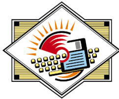
Business, Management Marketing & Technology