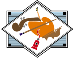
Arts & Communications