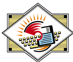
Business, Management Marketing & Technology