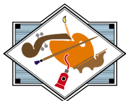
Arts & Communications