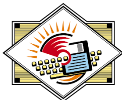
Business, Management Marketing & Technology