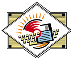
Business, Management Marketing & Technology