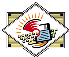
Business, Management Marketing & Technology