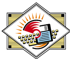
Business, Management Marketing & Technology