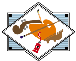
Arts & Communications