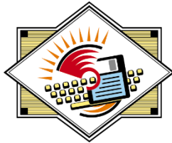
Business, Management Marketing & Technology